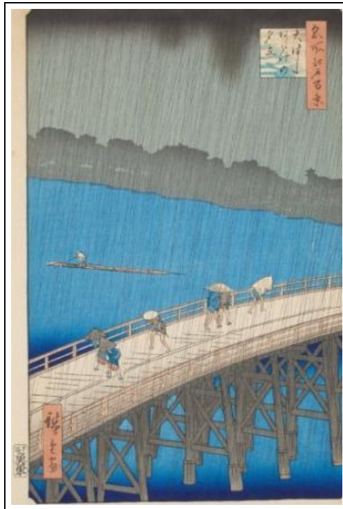
Filesize: 3.64 MB